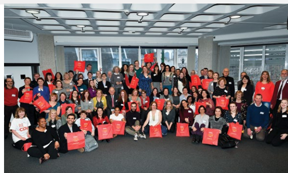
Above: Members' Day March 2018