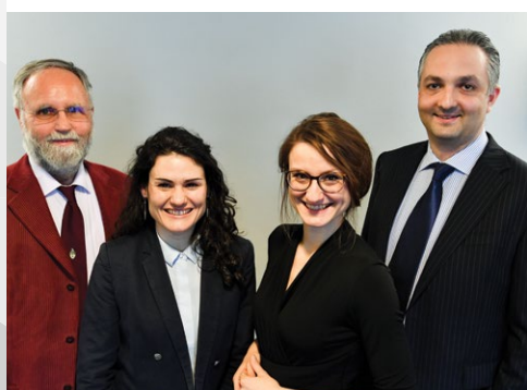
Newly elected members of council